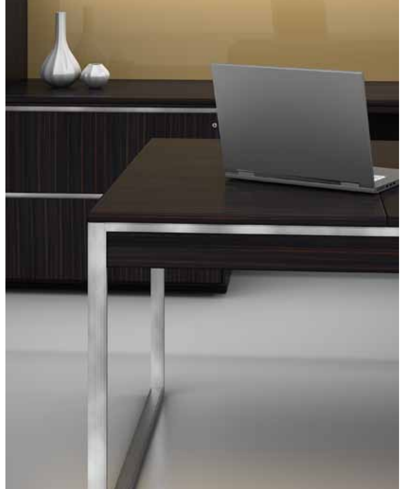
The finely crafted GL collection offers distinctive finish options for creating understated or dramatic design statements. Shown in Quarter Cut Ebony, Brushed Stainless Steel