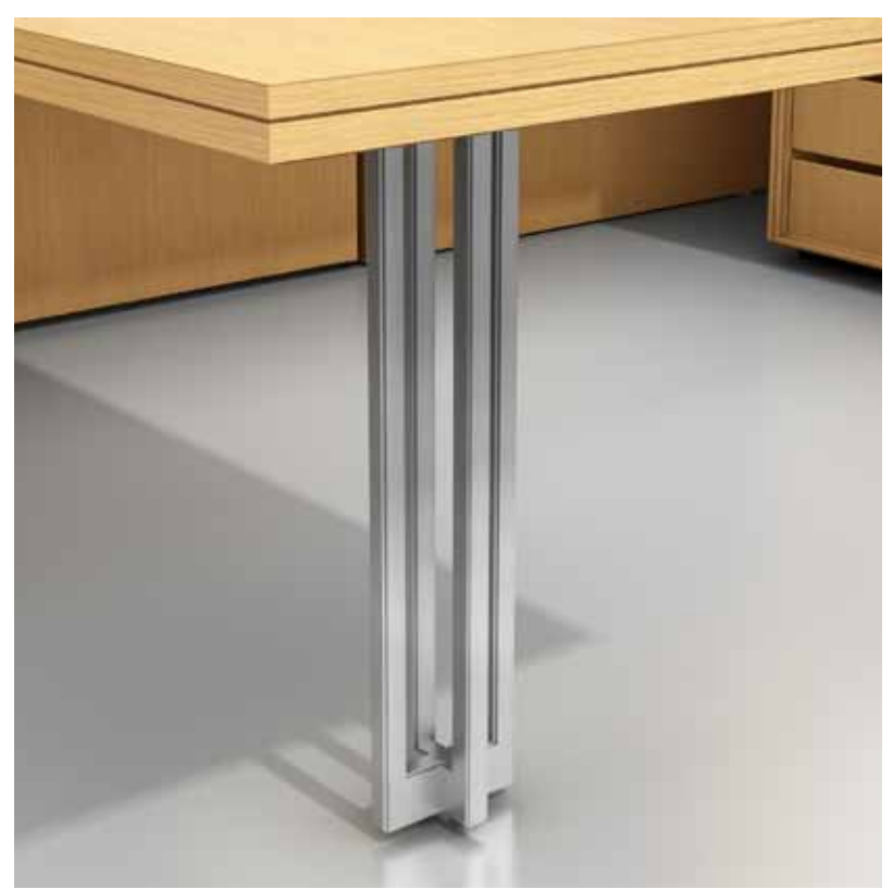
Optional lacquer or metal pinstripe, in the edgeband reveal, represents Decca's precision manufacturing and strict attention to detail. Shown in Rift Cut Oak, Polished Stainless Steel.