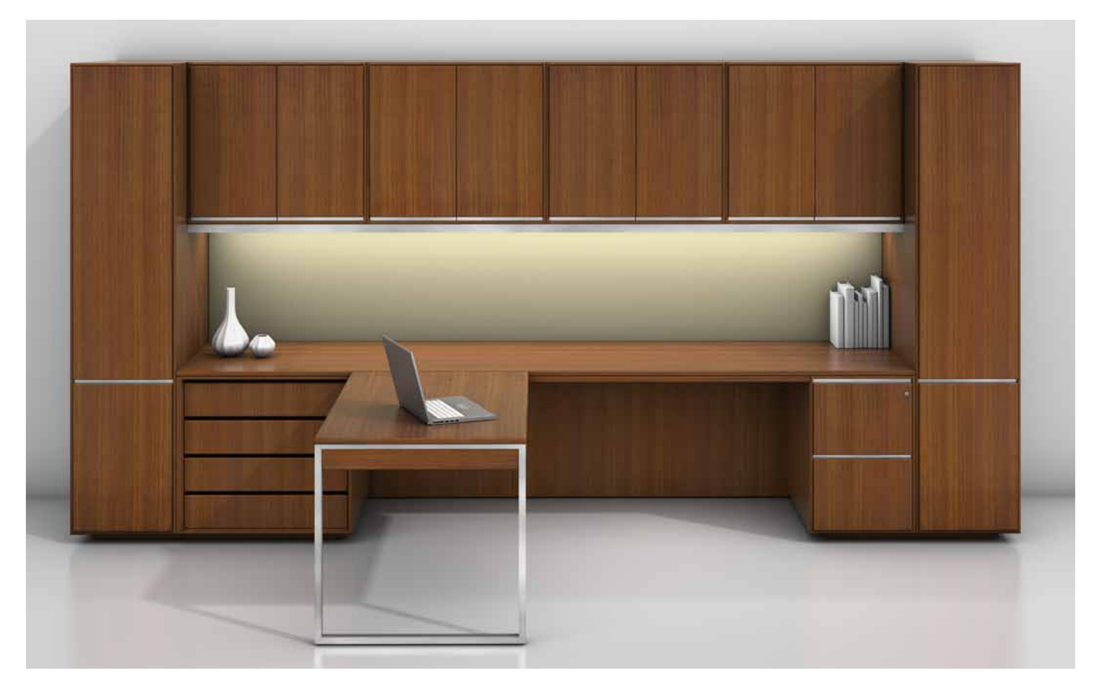
Storage components and work surfaces may be configured to suit virtually any enclosed or open space and diverse functional requirements. Shown in Quarter Cut, North American Walnut, Brushed Stainless Steel.